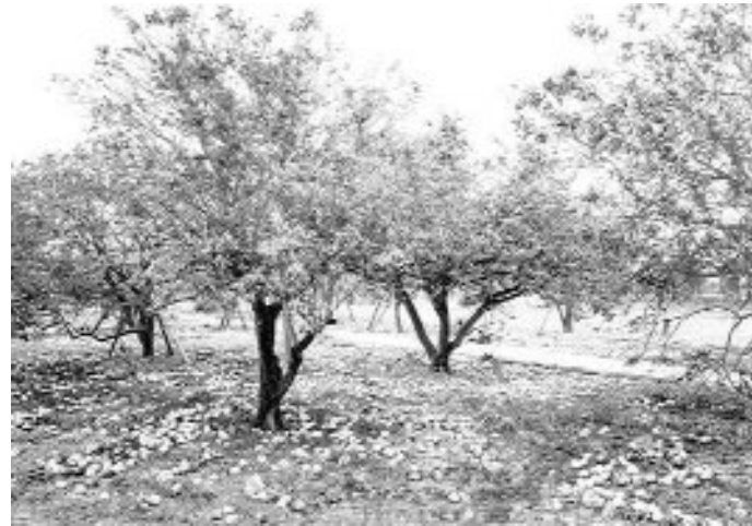
The weather is a concern for farmers. Grove owners' crops could be ruined by a freeze or a storm. This picture shows Florida citrus on the ground, blown off the trees by a September hurricane in the early 1900s.