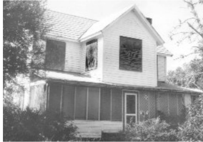
The main house, shown above, has an enclosed screen porch along its eastern face. Perpendicular to the main house is the older portion, shown below. Referred to as the attendant home, this section has three rooms and is partially ceiled. It is currently connected to the newer house at the kitchen of the latter. The home stands in an old citrus grove, and there are the remains of outbuildings in the hammock to the west. Adjacent to the home is an enormous hickory tree.