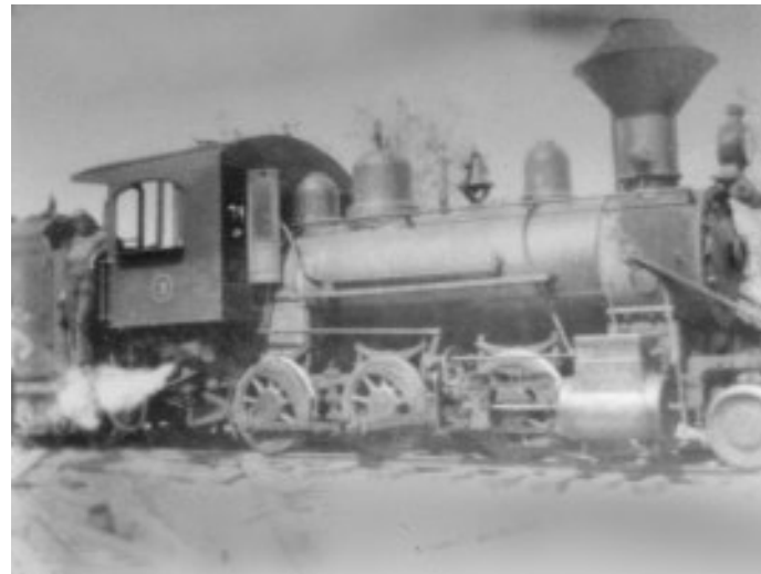
These photos, taken about 1923-4, are of the Union Cypress ferry train. At the left, automobiles ride atop the flat cars leased from FEC. Above is the Union Cypress train engine.

The soft swamp muck made building a good highway fill very difficult. When the highway contractor defaulted, frustrated travelers unjustly accused Union Cypress of charging exorbitant fees ("$2.00 to $3.00 per auto"), making excessive profits, and even purposefully delaying the completion of the highway. Profit from the ferry train did partially offset company losses in 1923. In 1924, earnings from the ferry train were sufficient not only to offset the loss in mill revenues, but also to show a substantial profit for the year. Ferry service ended when the highway was re-opened on January 21, 1925.