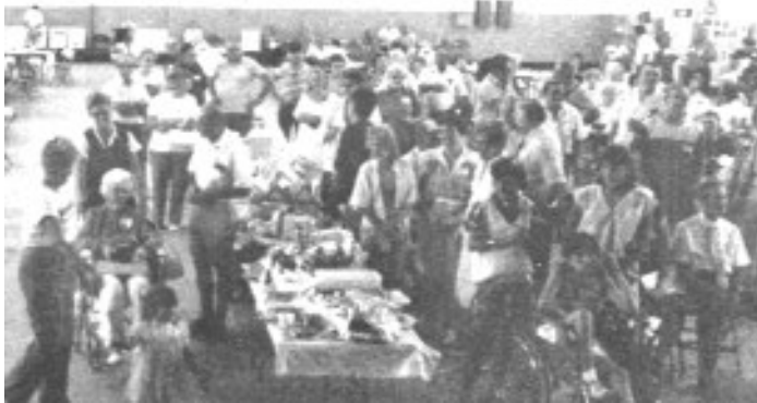
A bigger-than ever crowd of Mosquito Beaters responded to the call for a get-together in 2003. Above, a few of the reunion participants visit, mull over Memory Books, scan displays, eat, and have a great time.