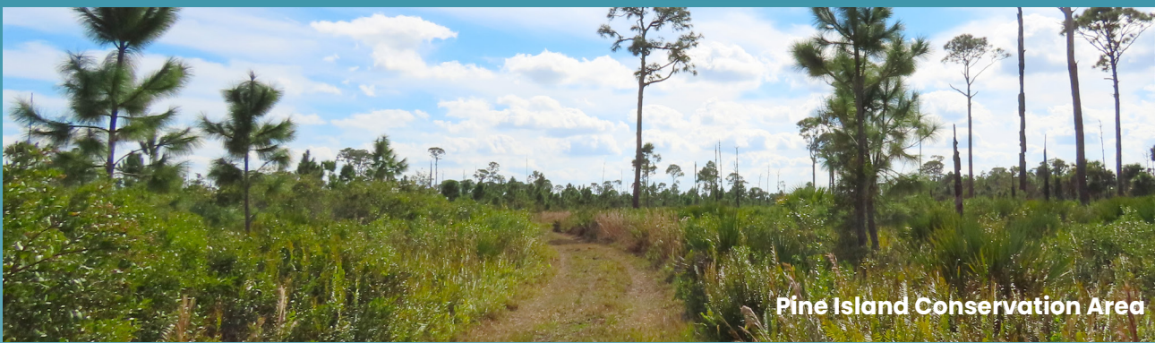
Pine Island Conservation Area

The mission of the Environmentally Endangered Lands Program (EEL) is to protect and preserve biological diversity through responsible stewardship of Brevard County's natural resources. To find out more about the program, please visit the EEL webpage . (321) 255-4466, EEL-Info@BrevardParks.com