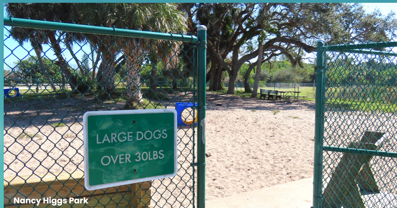
Nancy Higgs Park