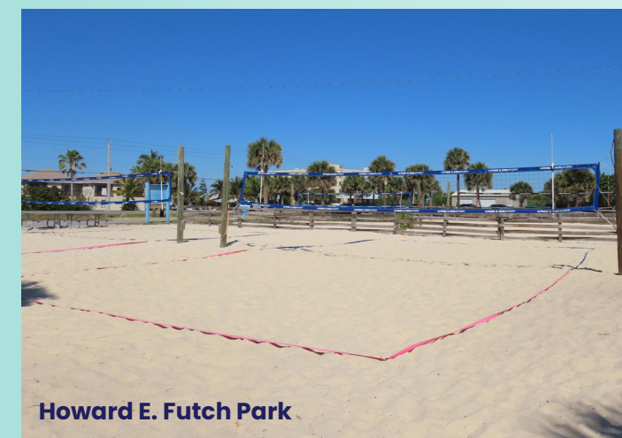
Howard E. Futch Park