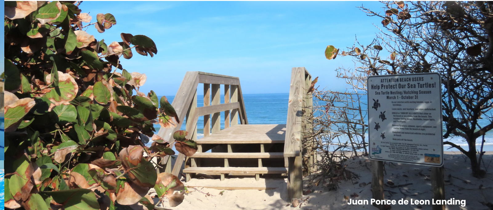
Juan Ponce de Leon Landing

The following county-maintained parks have direct access to the beach.