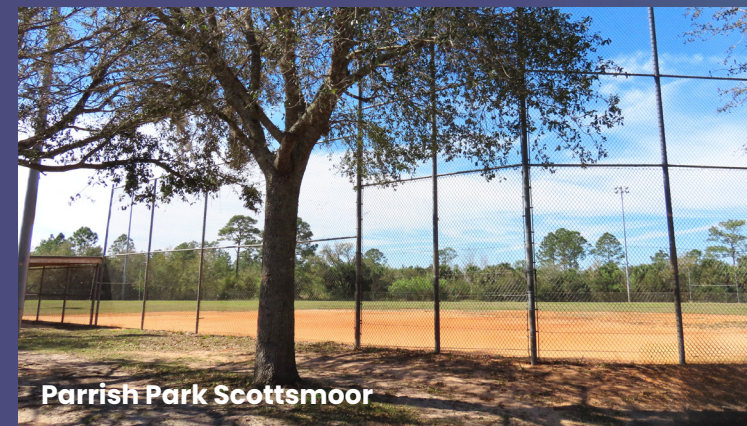
Parrish Park Scottsmoor