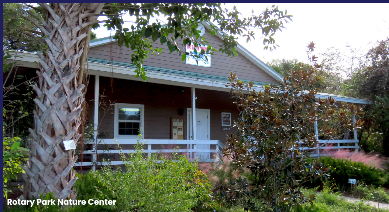
Rotary Park Nature Center