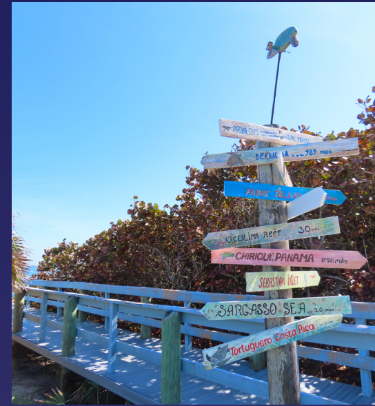
Doc Ehrhart Sanctuary