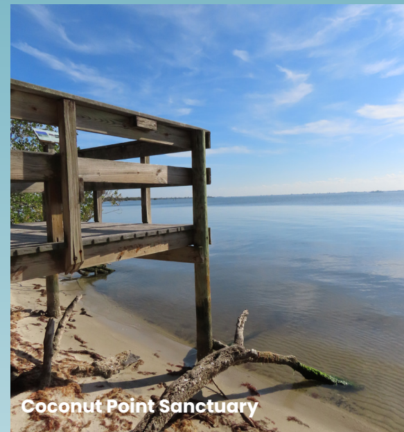
Coconut Point Sanctuary