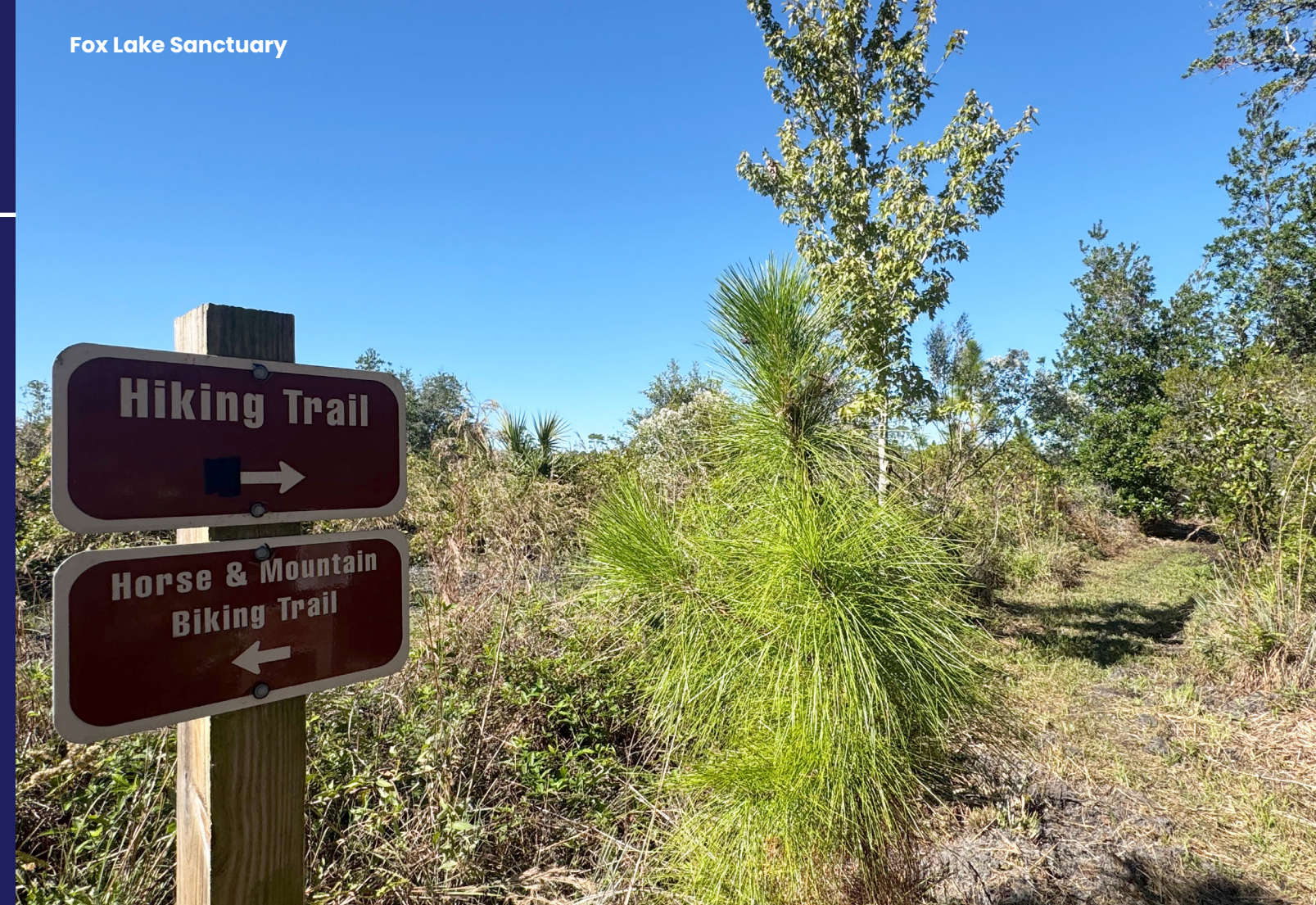
Fox Lake Sanctuary