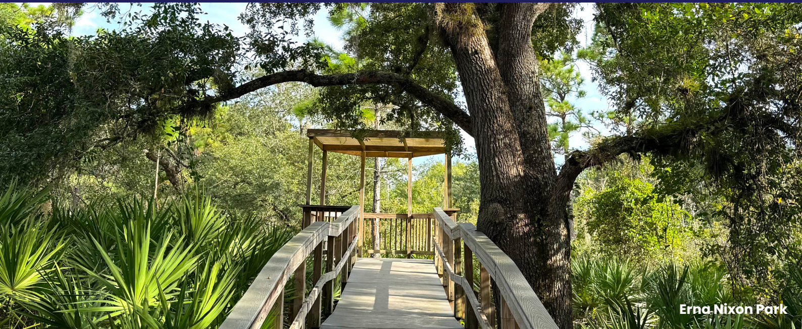
Erna Nixon Park