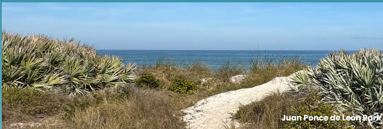
Juan Ponce de Leon Park

The Central Area is the home to numerous recreational opportunities at its parks, boat ramps, aquatic centers, and beach access sites in Cocoa, Cape Canaveral, Cocoa Beach, Rockledge, and Merritt Island. (321) 633-1874, CentralAreaParks@BrevardFL.gov