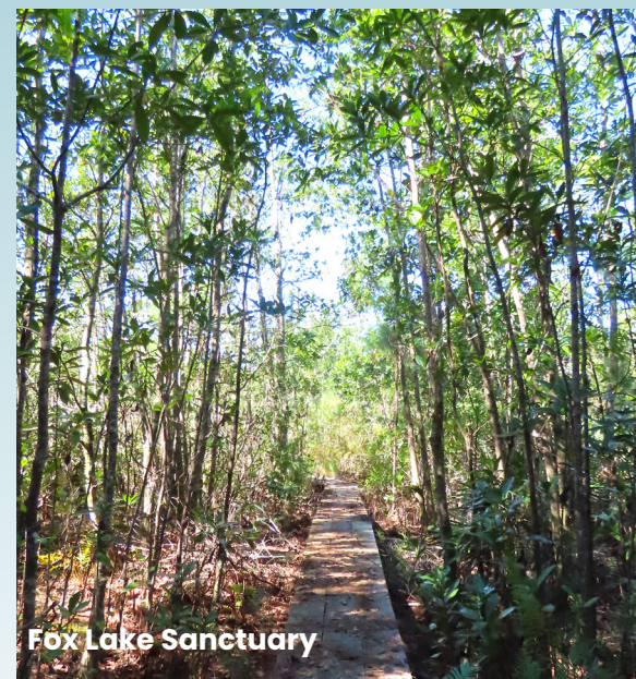
Fox Lake Sanctuary