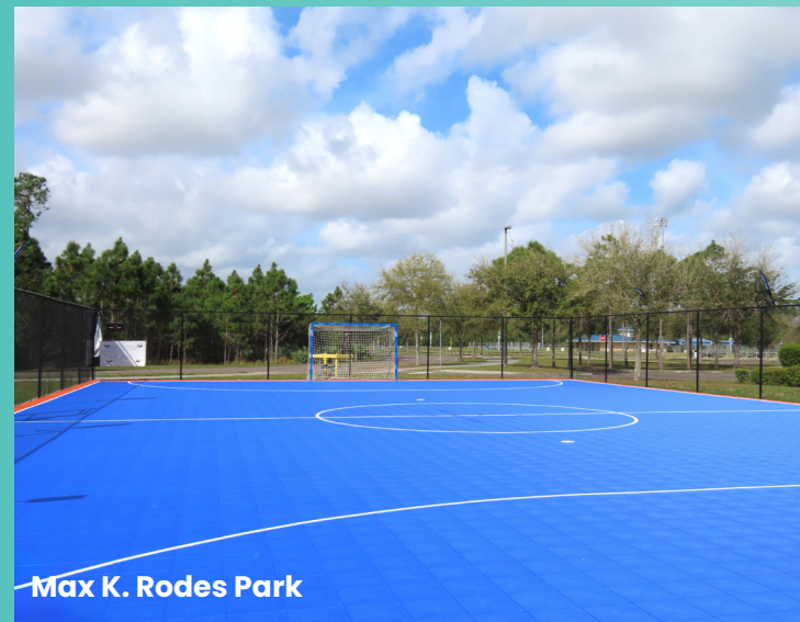
Max K. Rodes Park