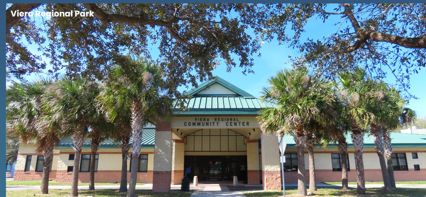
Viera Regional Park