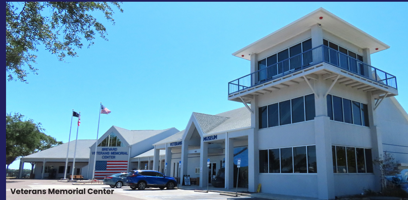
Veterans Memorial Center