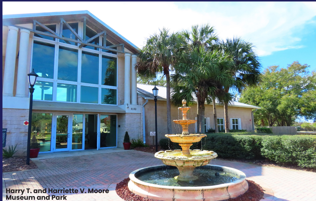
Harry T. and Harriette V. Moore Museum and Park