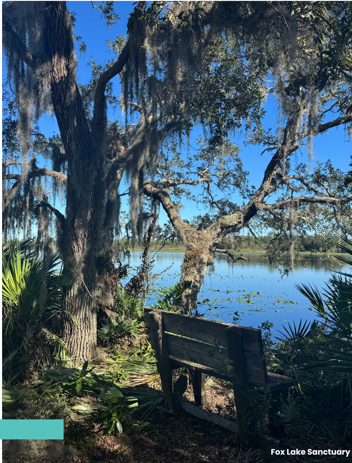
Fox Lake Sanctuary