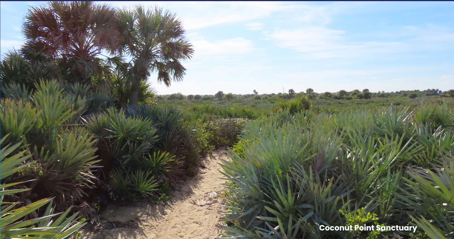
Coconut Point Sanctuary