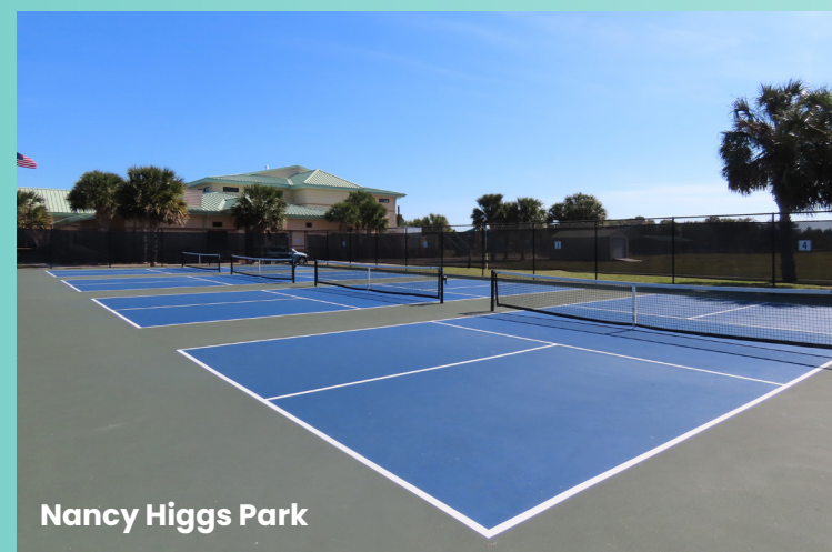
Nancy Higgs Park