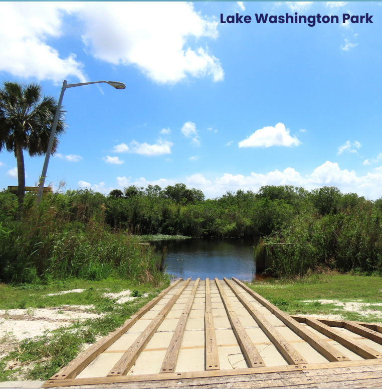
Lake Washington Park