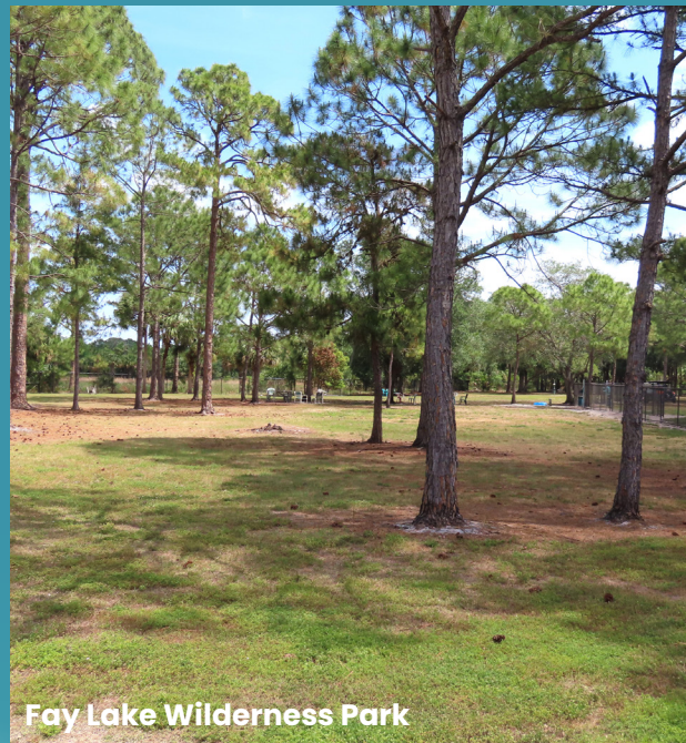
Fay Lake Wilderness Park