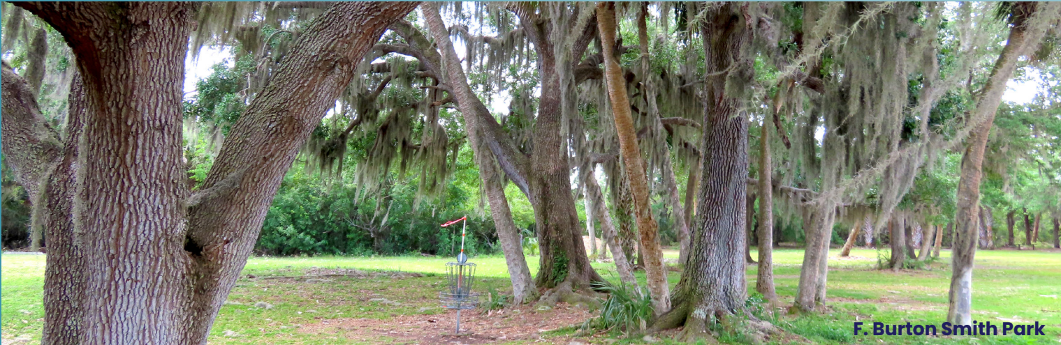
F. Burton Smith Park