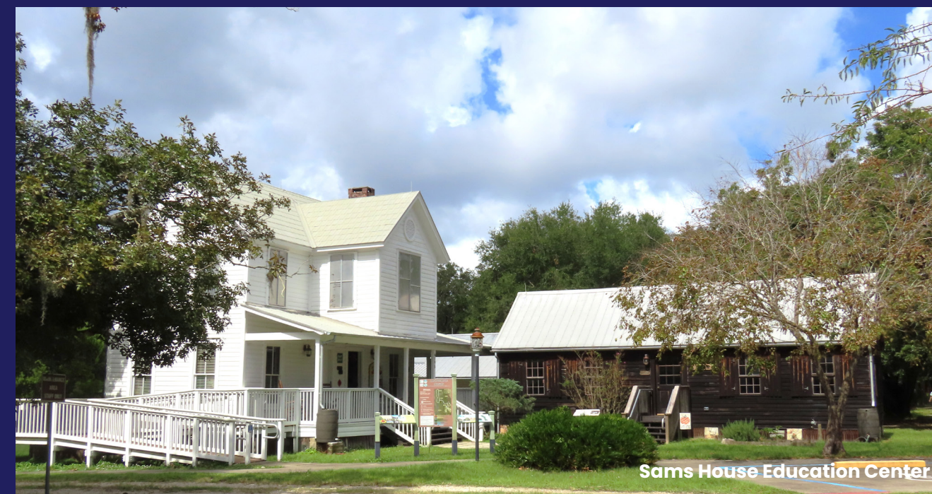
Sams House Education Center