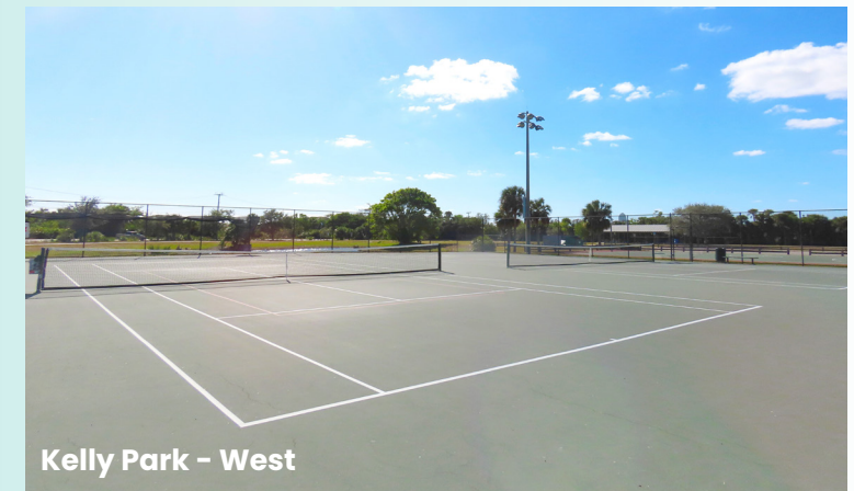
Kelly Park - West