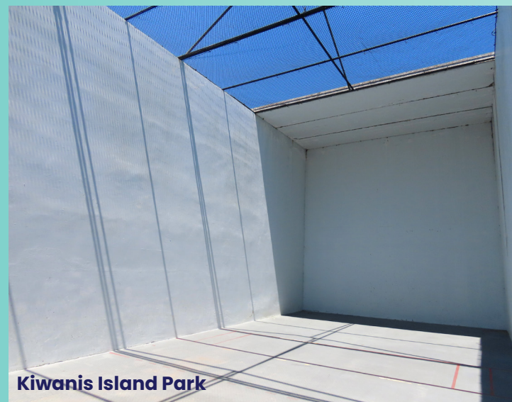
Kiwanis Island Park