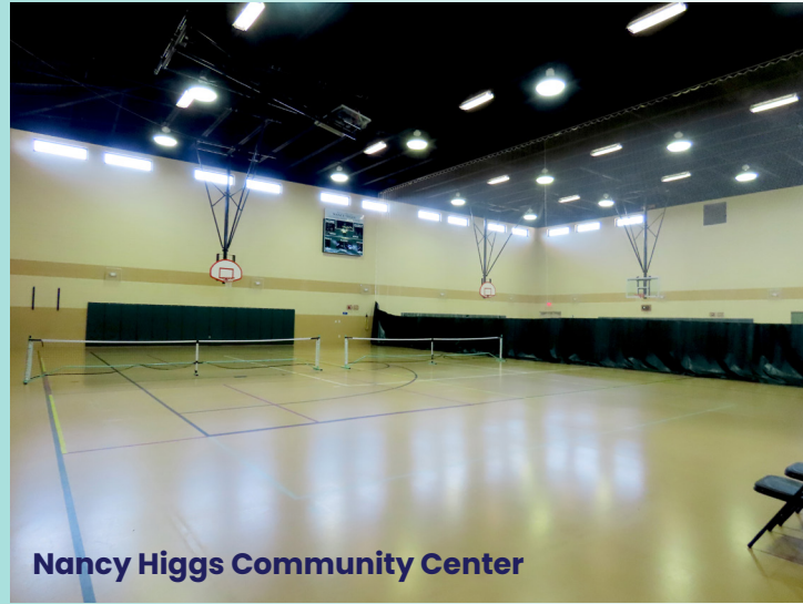
Nancy Higgs Community Center