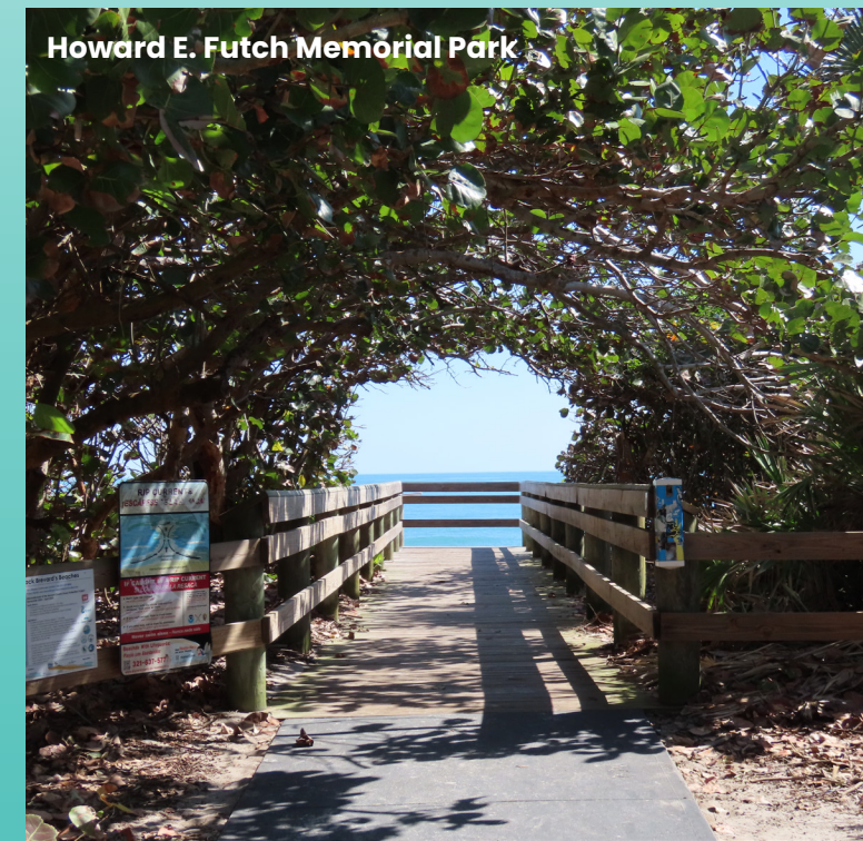
Howard E. Futch Memorial Park