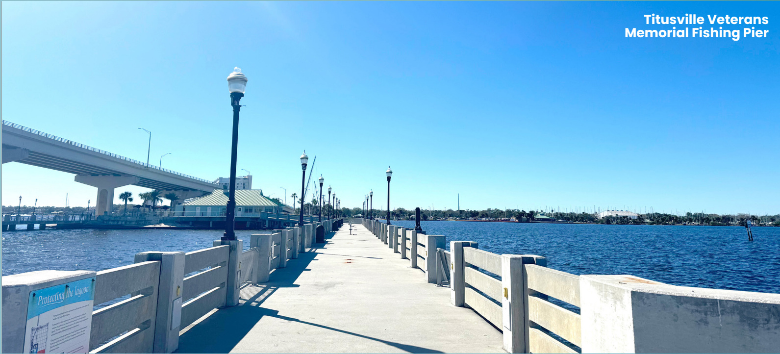
Titusville Veterans Memorial Fishing Pier