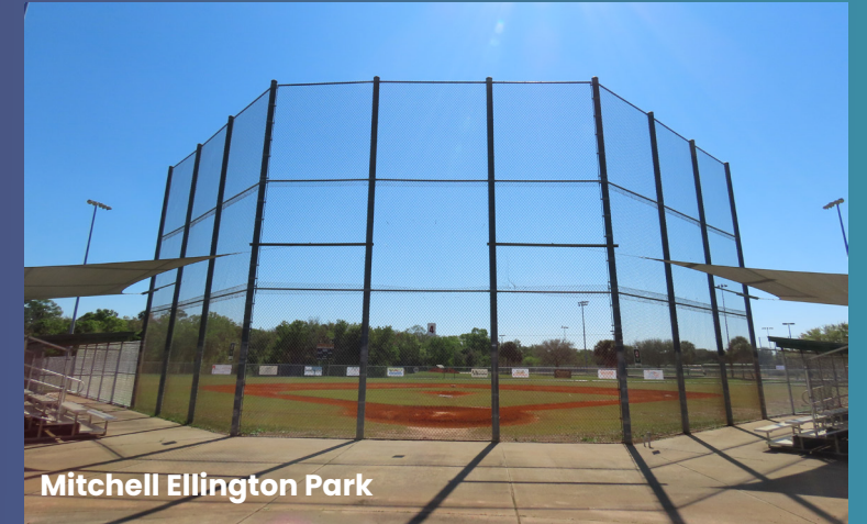
Mitchell Ellington Park