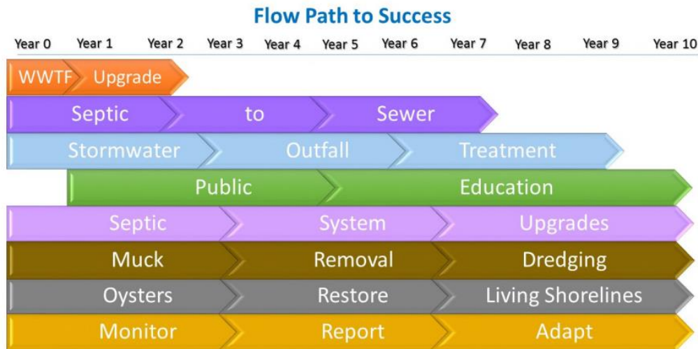
Figure ES-1: Save Our Indian River Lagoon Project Implementation Schedule

The plan was estimated to go for a timeline of 10 years. The Committee will expedite the process by allowing for spending on approved projects earlier than the schedule in the plan as revenues continue to exceed expectations, to-date. The flow path to success was updated in the second annual plan update, to include public education outreach for the life of the project.